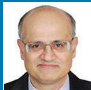
Chancellor Shri. Vijay Keshav Gokhale