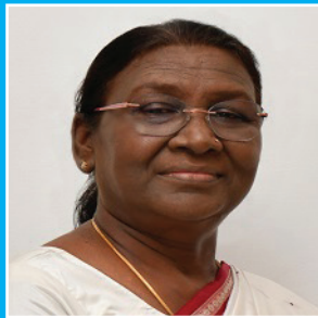
Visitor Smt. Droupadi Murmu Hon'ble President of India